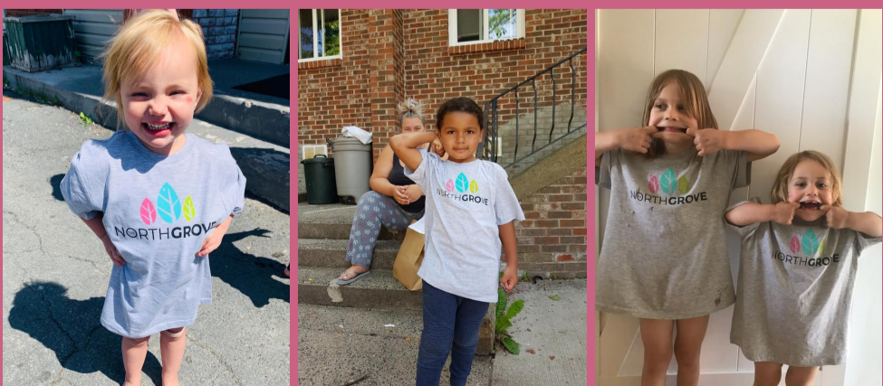
We delivered care packages including new North Grove t-shirts to community members and families.

"The place looks wonderful, can't wait to get back and see it in person... and look no stairs!! Congrats on your new space."